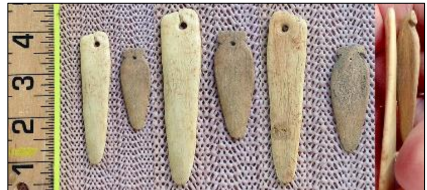
Upper Left: Bone Awls from Oregon.