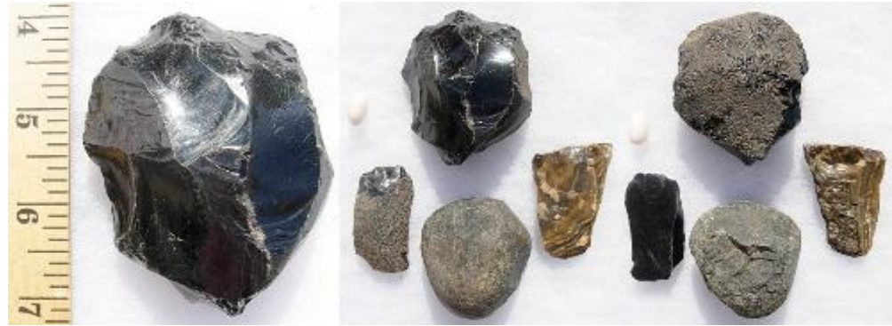
Stone artifacts from Oregon.