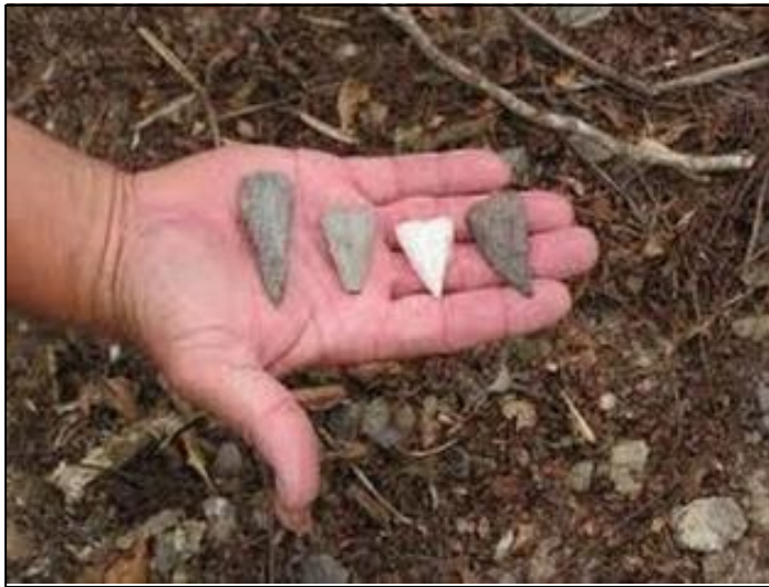
Stone artifacts from Washington.